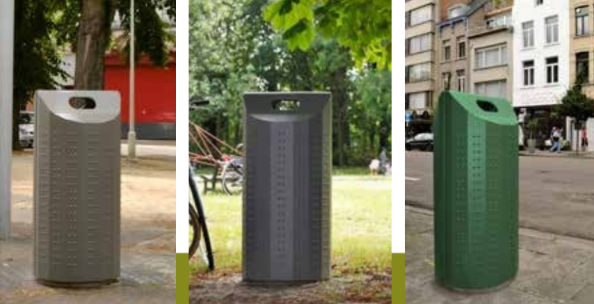
For sports grounds, leisure parks, city environments: the Pillar is grey as standard, but is available in different RAL colours upon request.